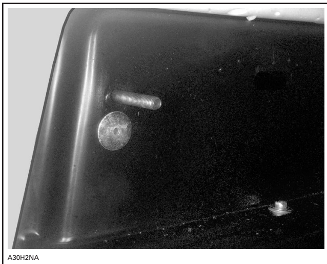
SHOWS "PLATE WITH SCREW" ALREADY RIVETED

Now insert each plate with screw from inside and secure them to base with a rivet no. 6 , from the outside. Refer to following photo.